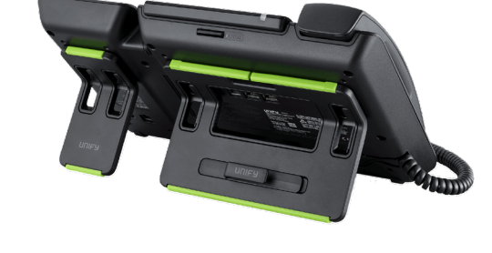
CP600 and optional KM600 key module (rear)